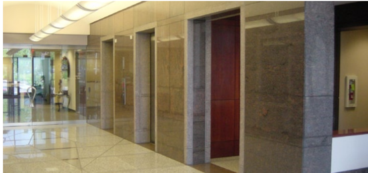
Marble and granite are a great contrast to the paneling.