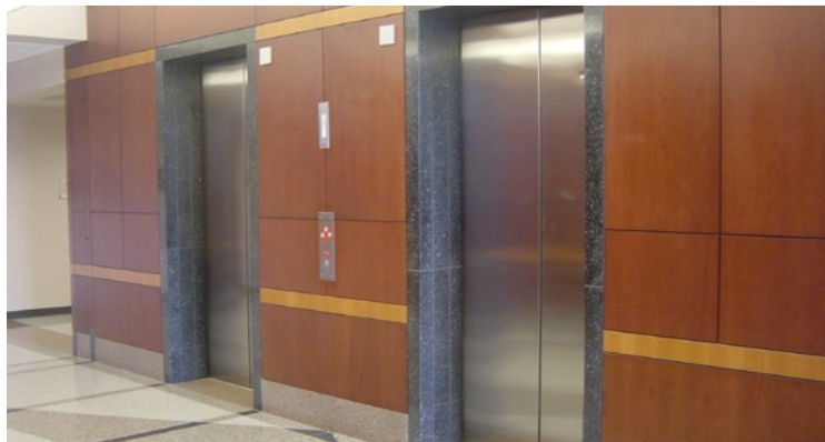
Two-tone cherry paneling trimmed with polished granite elevator surrounds creates a striking entrance and lobby.