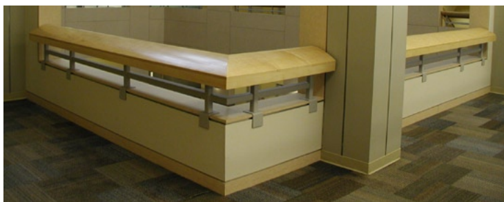
Solid maple hand rail caps accent the open floor design