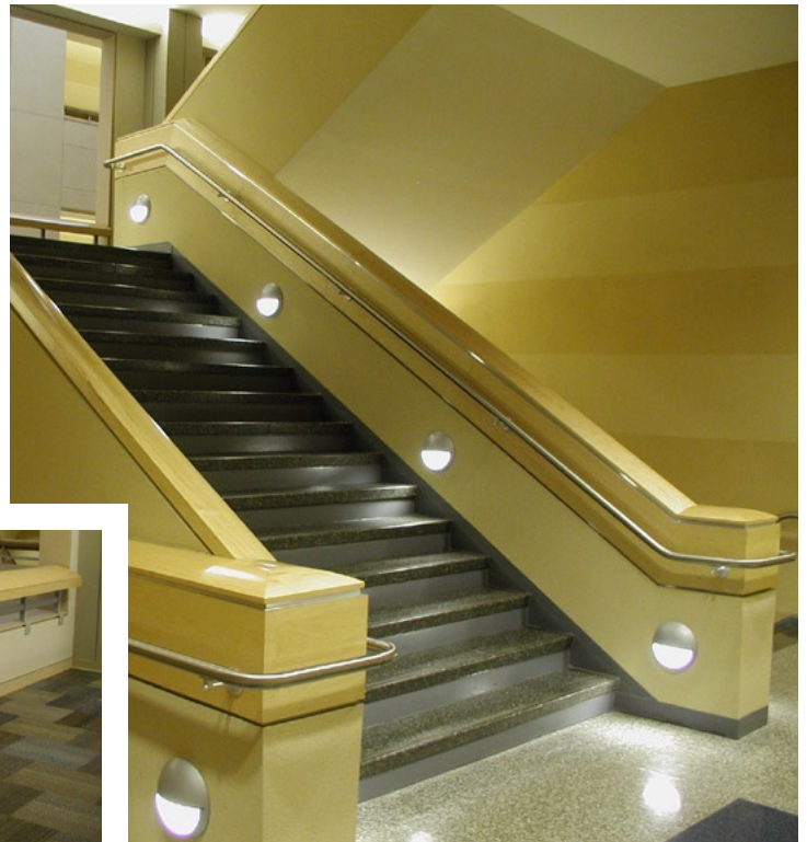
Maple wall cap with a touch of stainless steel reveal highlight the grand stair