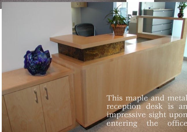
This maple and metal reception desk is an impressive sight upon entering the office