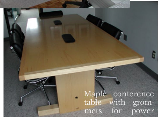
Maple conference table with grommets for power