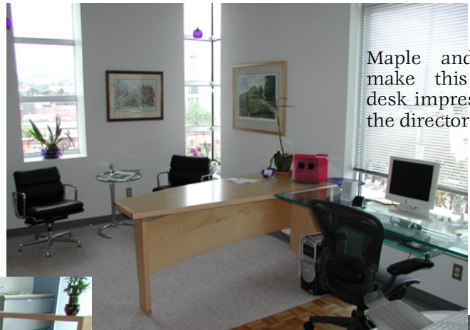
Maple and glass make this office desk impressive in the director's office